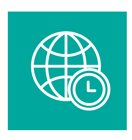
Agenda saw experts from diverse time zones, hence posing coordination challenges