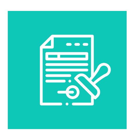
Registration data accumulation for various parallel sessions