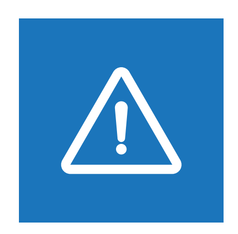
Restricted usage of hosting tool (in this case, Zoom) in China