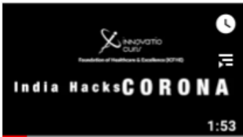
India's support to the participants