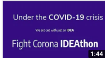
Tribute to the participants